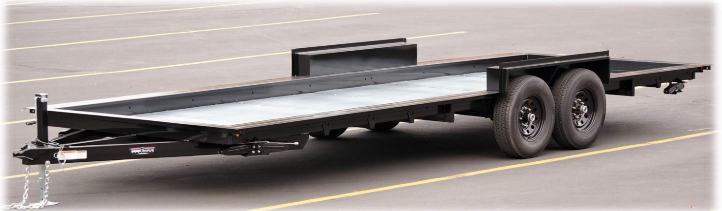
Pictured above is a PAD-14k24 equipped with optional Galvanized Bottom Pan, Fender Flashing, and Leveling Jacks

Our PAD series trailers are specifically engineered as a foundation for a tiny house. Every detail of the frame is tailored for supporting a tiny house structure and its contents. For example, the crossmember supports are recessed 6" below the top of the frame to accommodate floor insulation without sacrificing any floor height. This feature also minimizes contact of the steel framework to the subfloor for greater thermal efficiency. Our PAD series isn't simply a modified flatbed trailer; it's designed from the ground up for one purpose only . . . to be the ultimate foundation for your tiny house.